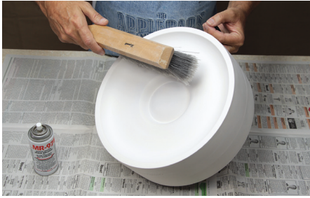
Brush the inside then coat with mold separator

Dry brush the inside of the mold to remove the loose boron nitride powder (be sure to wear dust mask when cleaning or applying mold release). Then spray-coat the entire inside surface of the mold with ZYP mold release (see Separation section on page 2).