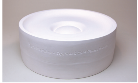
Footed Platter side of BinaSphere Mold