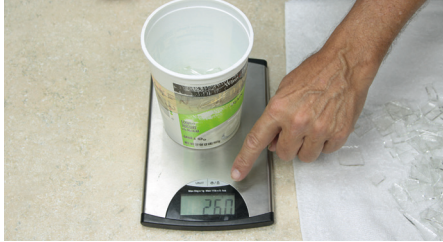
Measuring 275 grams using a digital scale

Prepare either the bowl or platter side of the Binasphere Mold using ZYP Lubricoat Boron Nitride spray (see Separation section at left). Then use mosaic nippers to break scrap glass into shards from 1/4" to 3/4" (6mm to 20mm). An all clear glass foot is classic but a mixture of clear with a complimentary color from your design can make a very impressive alternative.