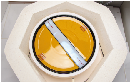
The slumped platter still in the kiln after firing

Carefully place the cast glass foot disk back into the casting reservoir (Note: cast disks from the bowl side and platter side are not interchangeable). Then place and center the pre-fused flat design disk on the upper flange of the Binasphere Mold.