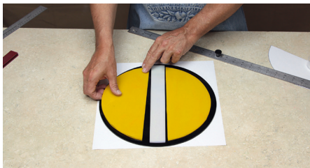
Create a 12" (30.5 cm) diameter design disk

Download the Full-Size Pattern for this Sedona Platter at: www.joyoffusing.com then click on Instruction Booklets for Fusing Molds under the Support Tab