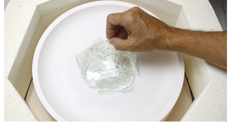
Filling the casting reservoir with clear shards

Place an empty container (such as this yogurt tub) on a digital kitchen scale and zero the tare weight then place 275 grams of glass shards in the container. Now place the Binasphere Mold in the kiln then fill the casting reservoir with the shards.