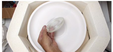
Cast glass foot disk made using 275 grams of scrap