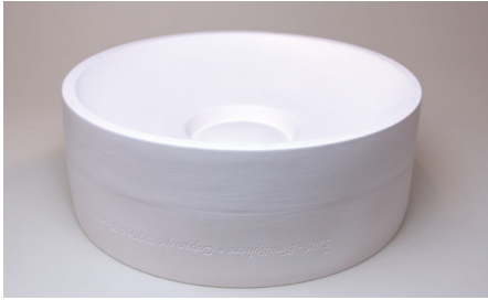
Footed Bowl side of BinaSphere Mold

Use this Double Sided Mold to Create an 11 1/4" (28.5 cm) Footed Bowl or an 11 5/8" (29.5 cm) Footed Platter