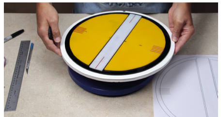
The Sedona design disk ready for fuse firing