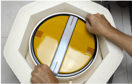
Center the pre-fused disk on the upper flange