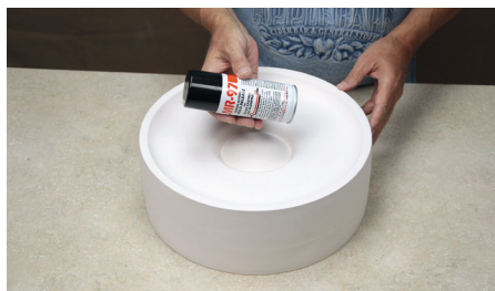
ZYP a Boron Nitride Mold Release spray

There are two general categories of release separators that are used on ceramic molds. One is a ceramic powder-type separator (aka shelf primer or kiln wash) and the other is