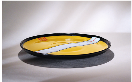
The completed Sedona Platter with Cast Foot

Free Video & eProject: Download other eProjects for this mold that include a fabrication video by registering your BinaSphere Mold at: www.joyoffusing.com