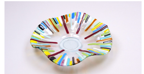
Radiant Bowl with Cast Foot 11 5/8" x 2 5/8" (29.5 x 6.7 cm)

The Flutter Mold Bundle is now in Full Distribution