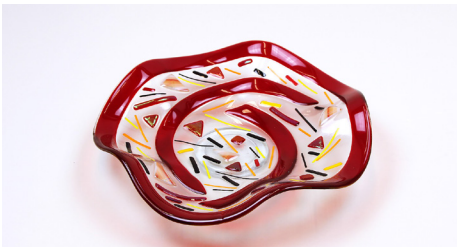
Red Swirls Bowl with Cast Foot 11 5/8" x 2 5/8" (29.5 x 6.7 cm)