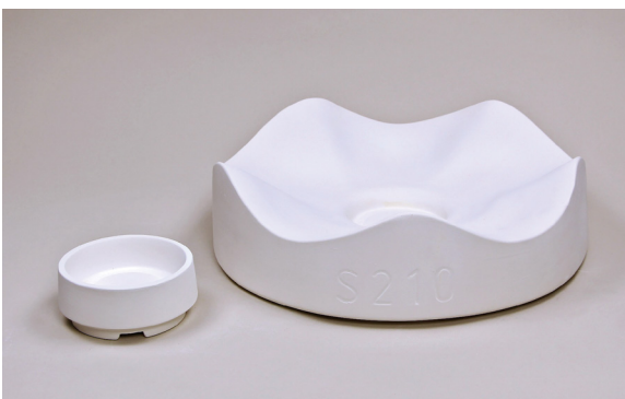
Flutter Mold with Foot Casting Mold

The Flutter Mold Bundle enables glass fusers to create a bowl that is 11 5/8" diameter x 2 5/8" high, with a cookie style foot, in a three-step process (29.5 x 6.7 cm).