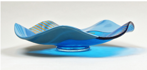
Strung-Out Bowl showing Cast Foot

Note: The fusing kiln chamber must be minimum 13" dia by 6" deep (33 x 15 cm).